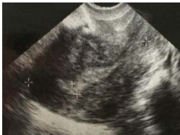
Figure 1. Transvaginal ultrasonography, showed the irregularity of uterine cavity with the thickness of endometrium being 4mm.

A 41 year-old mentally-retarded, nulliparous woman presented with abnormal vaginal bleeding. Pelvic examination showed a 2x2 cm-sized polypoid mass protruding from the external cervical os. The surface of the mass was smooth with no findings of necrosis or hemorrhage, and the mass was relatively hard. The presumptive diagnosis was a pedunculated leiomyoma and a different diagnosis was an endocervical polyp. Transvaginal ultrasonography showed an irregularly-shaped uterine cavity with no apparent mass lesions. The thickness of endometrium was 4mm (Figure 1).