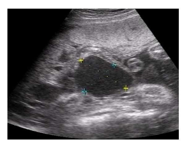
Figure 2. Dilated subchorionic vessels at 30 weeks' gestation. The diameter is up to 5.1 centimeters.

Transabdominal ultrasound study at 30 weeks' gestation. One part of placenta (circle) is filled with multiple small hypoechoic cysts.