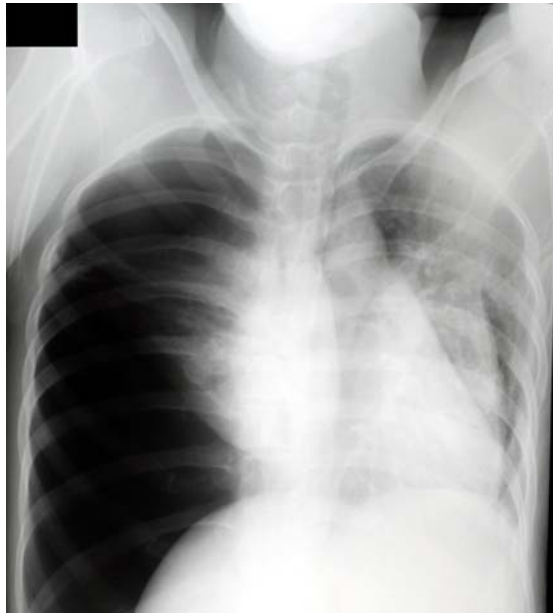
Figure 1. Chest radiograph image shows an almost complete pneumothorax in the right lung.

About 34 days after discharge, at 41 weeks' gestation, there was spontaneous onset of labor. After normal labor progression, the patient gave birth to a normal male infant with a birth weight of 2,744 g and Apgar scores of 9 at both 1 and 5 minutes. The patient's postpartum course was uneventful. Computed tomography (CT) scan of the chest on puerperal day 3 showed a few bullae at the apex of the bilateral lung, but the right lung remained expanded (Fig. 2). No surgery was performed and she has had no symptoms during the 16 months since delivery.