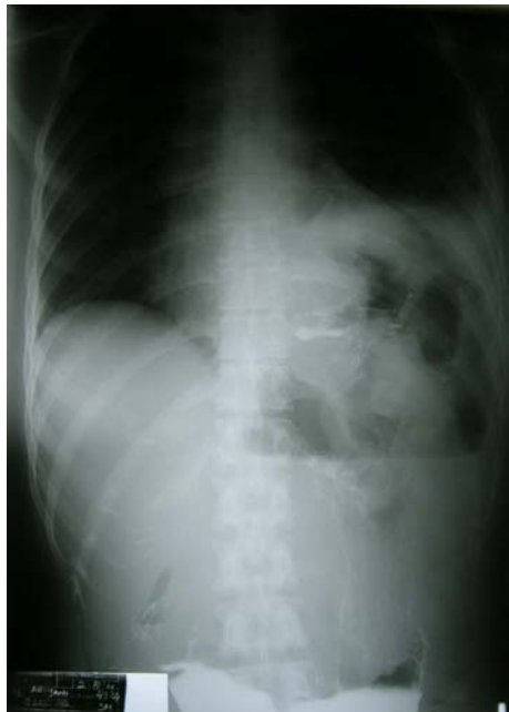
Figure 2: Chest X-ray: Suspicion of Chilaiditi's sign, differential diagnosis lower left lung abscess