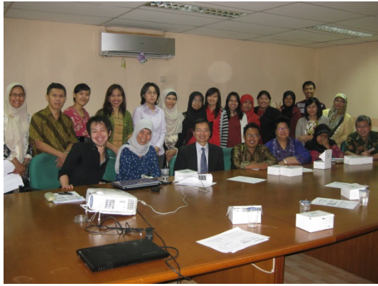
(Fig.6) Participants of Progress Report