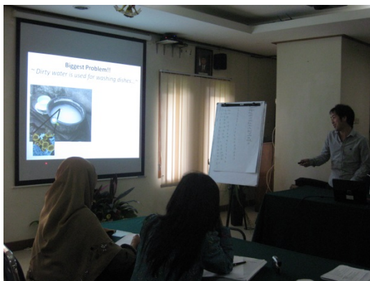
(Fig.4) Presentation about food sanitation

Activities: I attended “Food and Safety” class that was arranged by SEAMEO RECFON. The main topic is prevention of food poisoning. In the class, we have some discussions and presentations. So, I could feel that my English skill has been improved (Fig.4). And, I could learn about food sanitation problems and prediction in Indonesia.