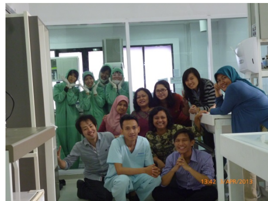
(Fig.2) IHVCB-UI Members