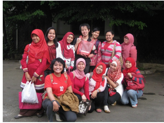
(Fig.7) Micro-UI members

In this program, I had not only as above statement, but also had opportunities to experience Indonesia customs and others. And, I could make some friends trying to improve our life. Opportunities and friends in this program will become my livelihood for future my career as a researcher. Thanks again for give me good opportunities.