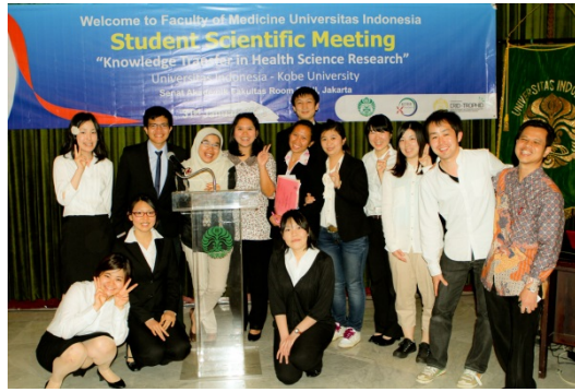
(Fig.3) Presenters of Student Scientific Meeting