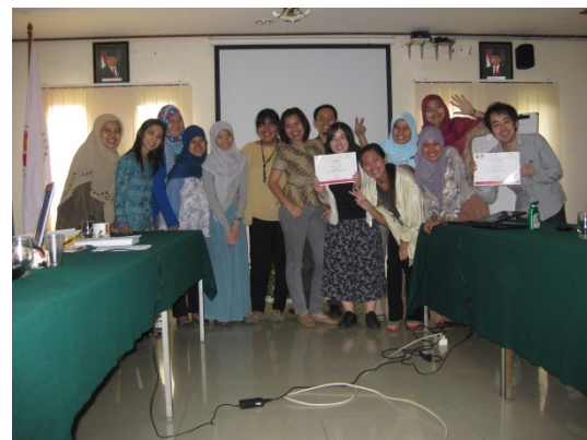
(Fig.5) Teachers and Students of “Food and Safety” class