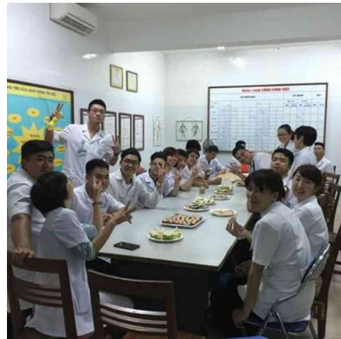
(right) With staff and interns in Bach Mai hospital