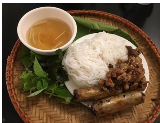
Bun Cha and Fried spring rolls