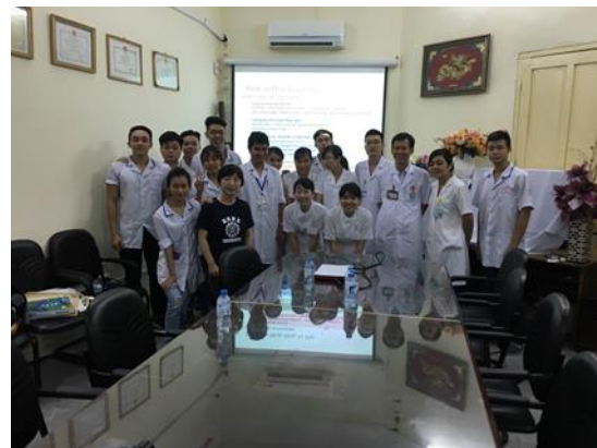
With staff after presentation