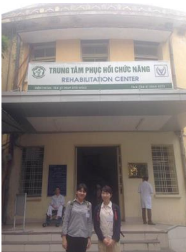
(left) In front of the rehabilitation center in Bach Mai hospital

Thanks for everyone concerned of the Bach Mai hospital, Kobe University and everyone who supported me for this program.]