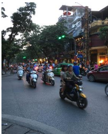
State of the traffic

Vietnam prices are cheaper than in Japan. Vietnam money is the Dong, 20,000 dong = about 100 yen. From the hotel to the hospital I had to take a taxi every time, it was cheap because of about 500 yen at a distance of about 15 minutes by car.