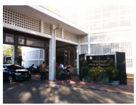
Institute of Tropical Disease

I got interested in how much research they do because there are a lot of tropical diseases here. Airlangga university has institute of tropical disease. This institute is cooperating with Kobe university. They investigated what serotype is major to use extracted dengue virus from mosquitoes. This serotype change is related to the number of increasing DHF. Because patient who had dengue fever got again different serotype of dengue virus, it makes the possibility of DHF high. Some researchers think that cross-reactivity of antibodies cause it. And they also do research about the effect of cooper for stopping mosquitoes eggs hatching. Indonesia has a lot of tropical diseases but they don't research for immunization. This research is very fascinating but it requires financial power and development skills. Even in our country, this reason may be one of problems. I think basic science in Indonesia should be invested more to increase circumstance for talented persons.