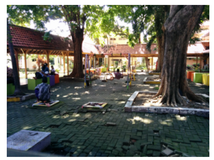
Playground for kids

There were infection we don't see often in