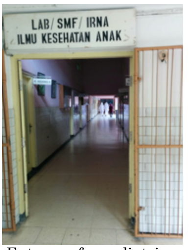
Entrance for pediatrics

* Pediatrics 40 to 50 medical students were rotating for three months in 14 divisions for each team. I chose tropical division as the main. I had to see patients with