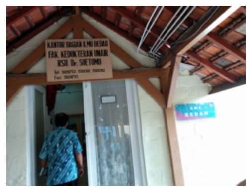
Entrance of surgery

In night duty, I saw a lot of patients with trauma. There are always accidents of motor cycles in Surabaya. I did suture in this time overseas. That was the first time and I got a little bit nervous.