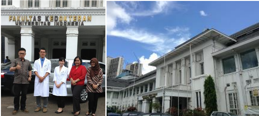
↑ Picture with staff of Coordinator-International Relations Office

Name of the hospital in which I experienced student exchange program is “RSCM”. RSCM is short for Rumah Sakit Dr.Cipto Mangunkusumo. Rumah Sakit means hospital in Indonesian language and Dr.Cipto Mangunkusumo is one of leaders of independence war. It is first national hospital in Jakarta and is main teaching hospital of Jakarta university. RSCM is located in Central Jakarta. White building in the cover page picture is front building of faculty of medicine which was built in Dutch colonial period about 200 years ago. Coordinator-International Relations Office is in this building.