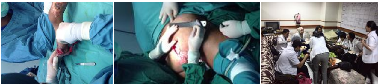
Left) releasing joint contracture by Z-plasty