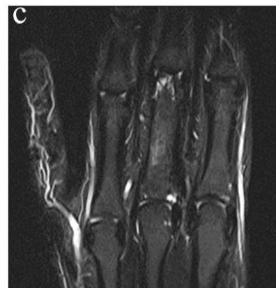
Figure 2. a. A-P radiograph after surgery b. MRI at one year postoperatively (T1 weighted image) c. MRI at one year postoperatively (T2 weighted image)

The section of the grafted bone area was completely same intensity of native bone. The patient's postoperative course was uneventful after a follow up period of two years after surgery (Figure 3).