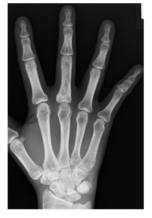
Figure 3. A-P radiograph at two years postoperatively

The section of the grafted bone area was completely same intensity of native bone. The patient's postoperative course was uneventful after a follow up period of two years after surgery (Figure 3).