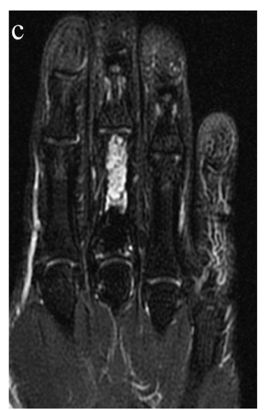
Figure 1. A-P radiograph (a) and MRI (b; T1 weighted image and c; T2 weighted image) at the referral visit to our hospital